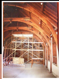
Restoration Work in 1994