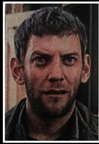
FACES OF THE OPERA HOUSE: (left to right) Charmion King, Kate Reid & Donald Sutherland